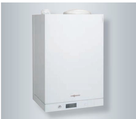
Vitodens 111-W with integral 46 litre stainless steel loading cylinder