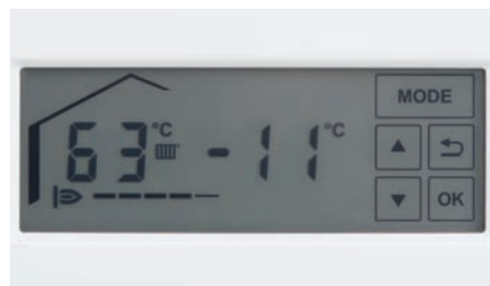
Backlit LCD touchscreen

The Vitodens 100-W and Vitodens 111-W wall mounted gas condensing boilers are controlled by the new, backlit LCD touchscreen, which makes it easy to use and read in dark environments.