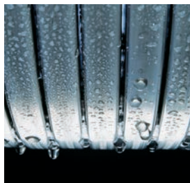
Inox-Radial heat exchanger – durable and efficient